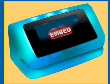
Also available with cardreader or DBA