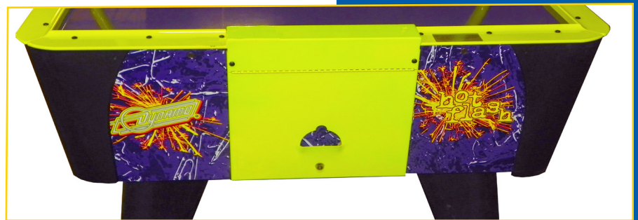
New graphics for an updated, contemporary look