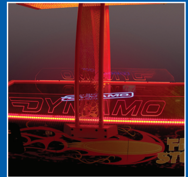
Protective 3-piece side shields are standard on each Fire Storm