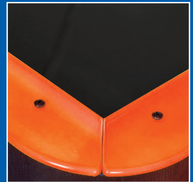
Rounded top rail design – no separate cover needed