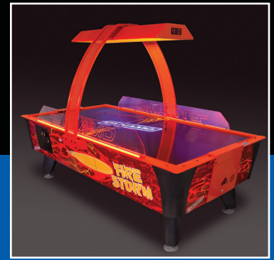
Bold glowing graphics come alive in blacklight

Product details and specifications subject to change. These images are as accurate as possible, LED Underlighting enhanced. Contact a distributor near you for information.